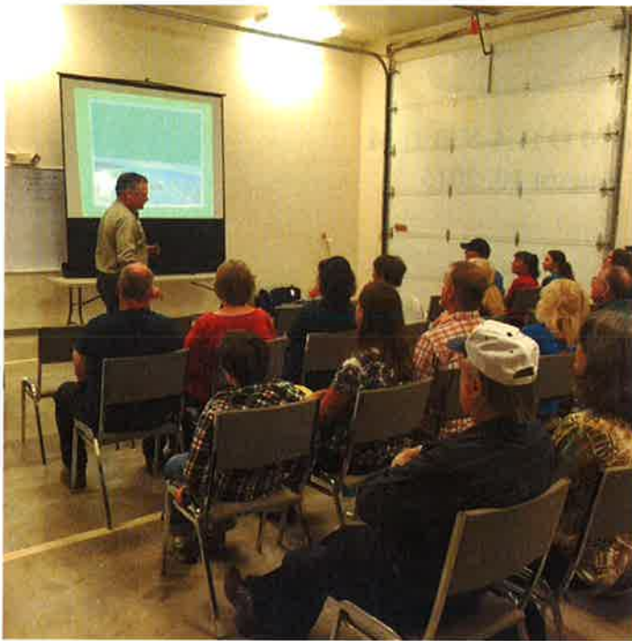
Living With Fire Presentation – July 18, 2015