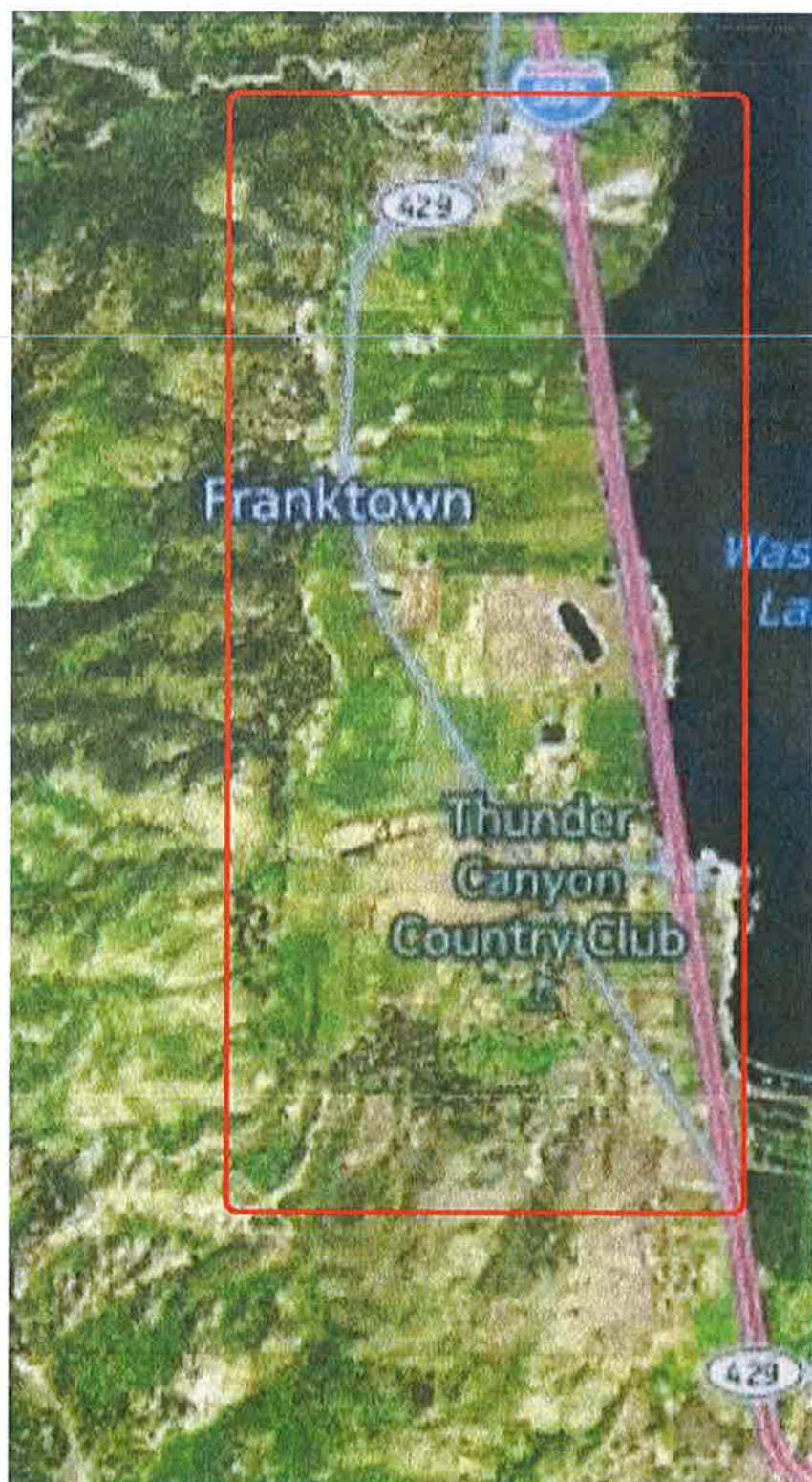
FIGURE 1 PROJECT AREA LOCATION