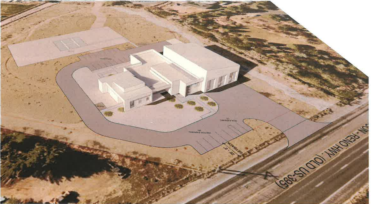
NW AERIAL VIEW