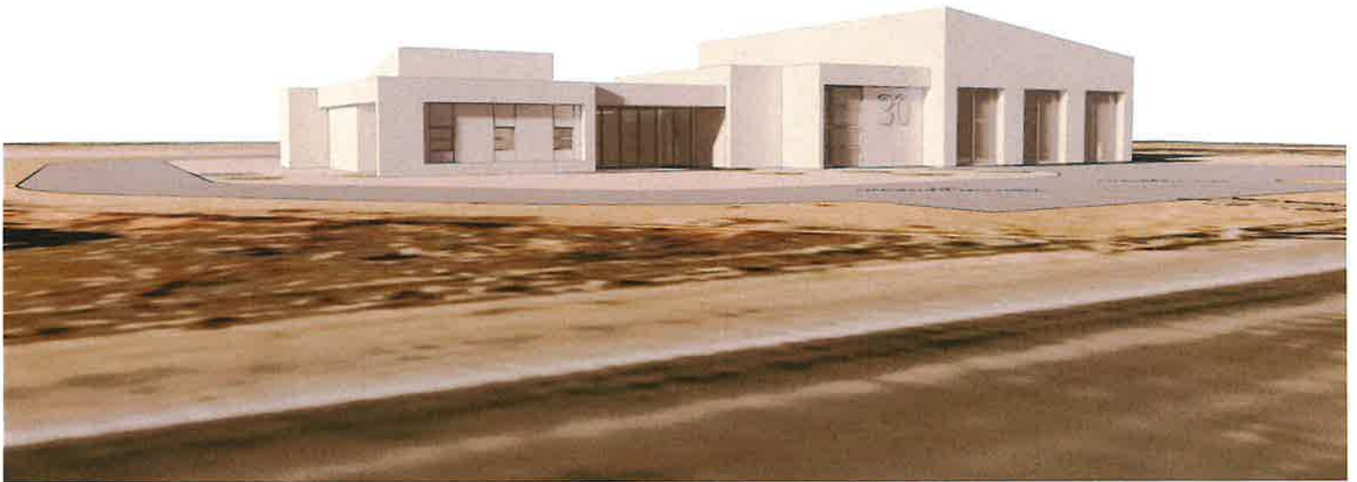
NW EYE-LEVEL VIEW